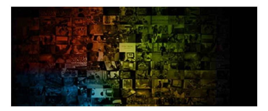
TECHNOLOGY NEWS | Tue Oct 4, 2016 | 8:30am EDT

Business Markets World Politics Tech Commentary Breakingviews Money Life